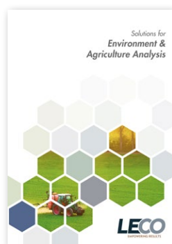
Environment & Agriculture 209-205-005