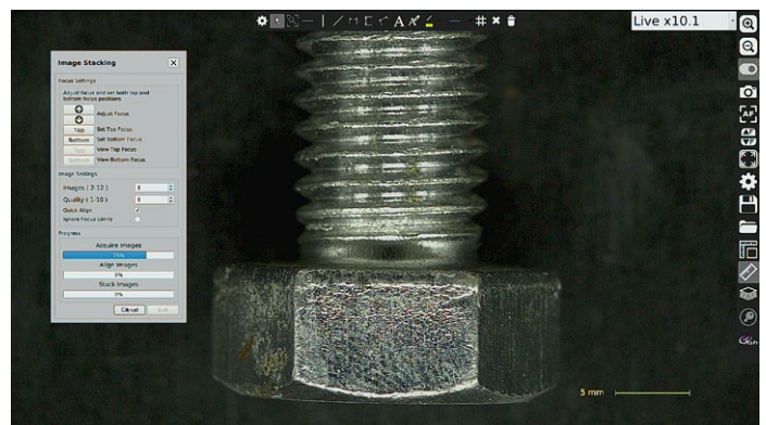
Stacking to create images of complex parts.