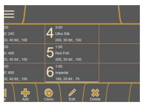
Create methods to match your exact preparation needs