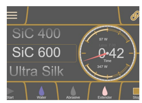
Guide the operator through your method with step-by-step instructions