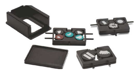
Stage Sample Holders