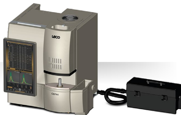
CS744 with high-velocity vacuum system

Performance Sulfur: Upgrades the standard flow controller with a thermally stabilised flow controller for improved baseline stability and precision