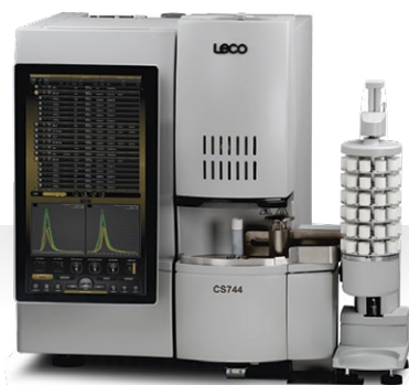
CS744 with optional auto loader